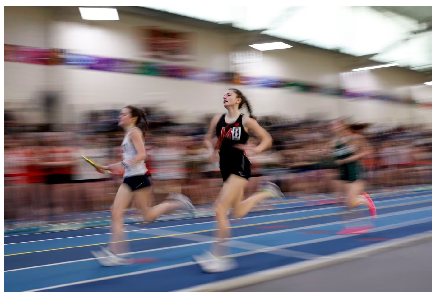
Girls run the 1600 sprint medley relay.